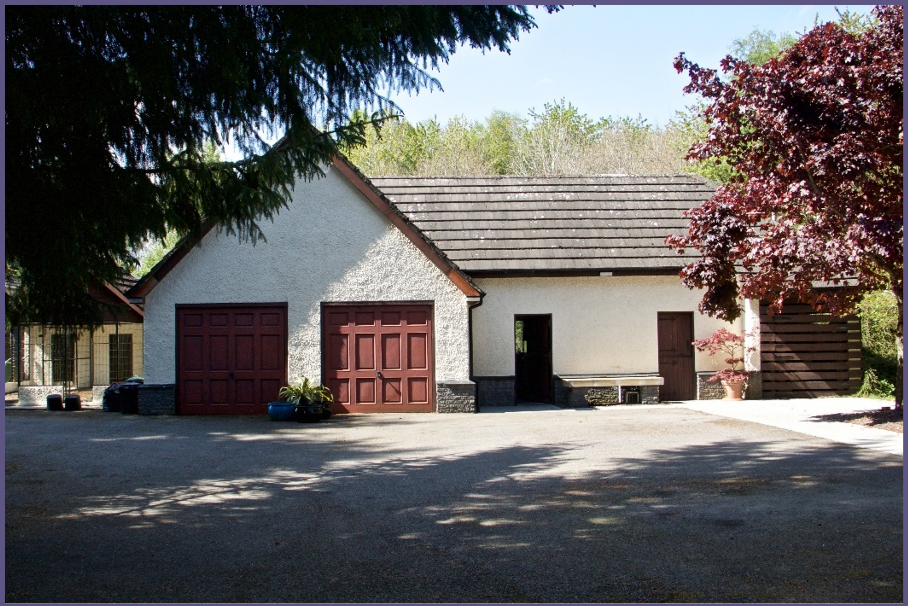
Garage & Stores